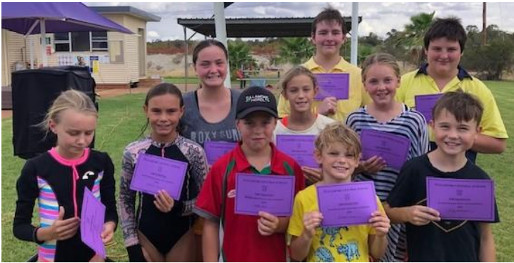
Congratulations Swimming Carnival Champions