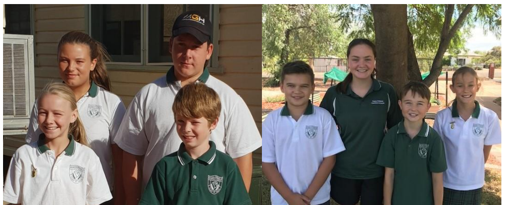
MACQUARIE HOUSE CAPTAINS LACHLAN HOUSE CAPTAINS