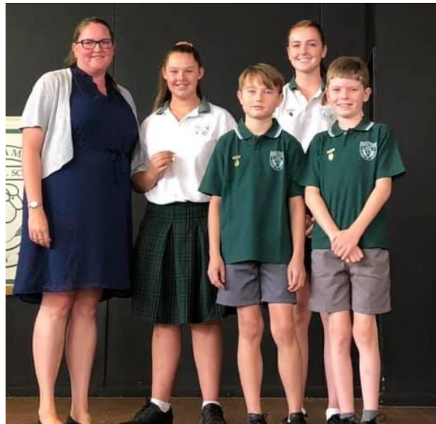
YEAR 6 GRADUATION