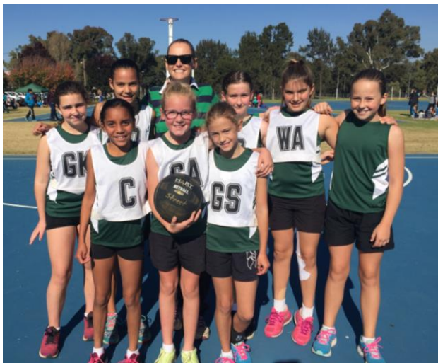
Go the Trullamore Netball Team

Unfortunately, NAPLAN has become an annual media (and social media) circus and as a political football gets plenty of kicking. This benefits no-one, least of all students and parents who have come to view NAPLAN as of over inflated importance. There has been significant misinformation, particularly relating to Year 9 students and their future HSC attainment, which has caused unnecessary distress. Aggregated results being used as a measure of individual school or teacher