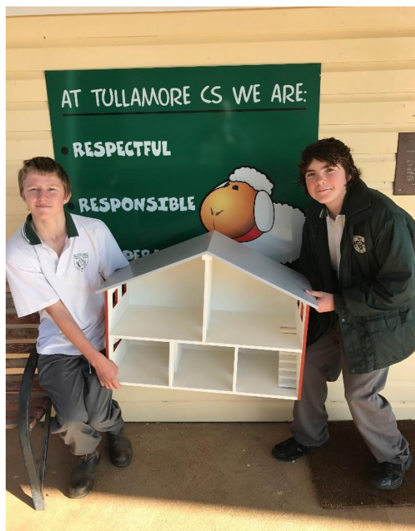
Our woodwork club built a dollhouse for the pre-school. Great job!

The most important NAPLAN data is individual student growth data. Consistently over the past 4-5 years and as presented at past P&C meetings and in past newsletters, the majority of Tullamore students have displayed growth rates well in excess of state averages across all categories. You can't ask for much more than that.