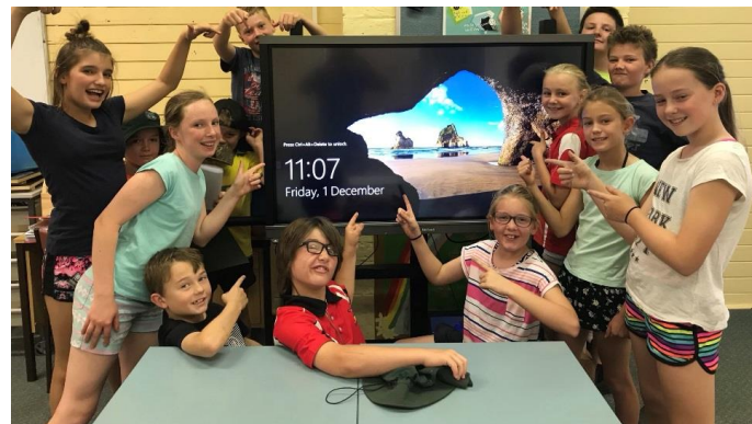
Cutting edge educational technology