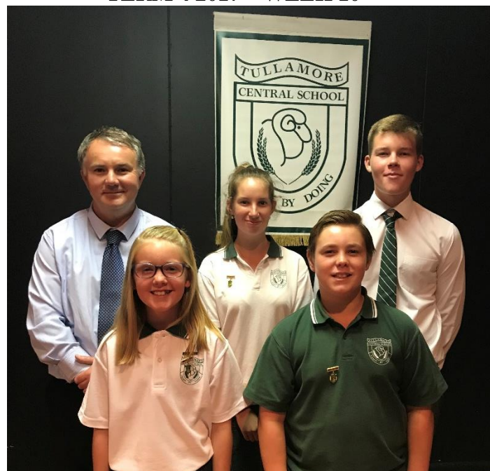
Our fearless leaders