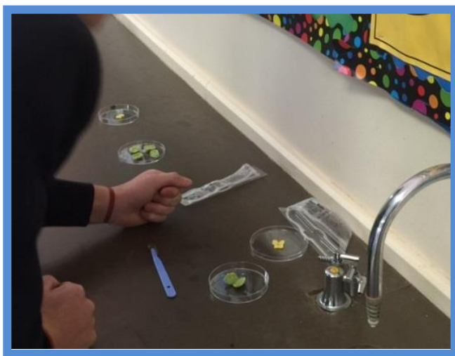
Students examining the difference between monocot and dicot seed structures and starch content.