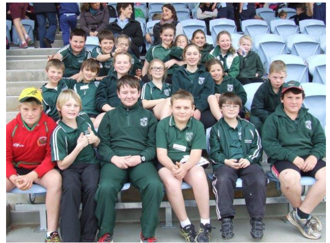
Tullamore's elite athletes having a rest