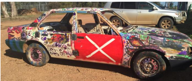
The Tully-mobile put on a gallant display in the demolition derby

Congratulations to all of our students and staff for their great show work. Some fantastic work was on display. Congratulations also to all of the staff and students who were involved in many and varied ways to make the show a successful event.