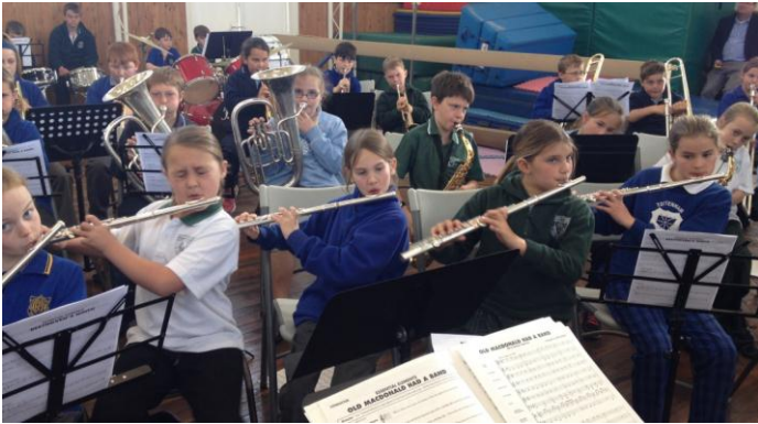
The big band is getting smoother and sophisticated

in students over a short time and practise makes perfect.