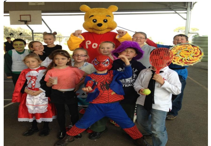
You never know who will turn up at Book Week

Don't forget on Tuesday September 8 th we are celebrating Book Week (belatedly!). Students and staff are invited to dress up as a book character of their choosing. In 2013 we had some amazing costumes, it would be great to some more this year!!