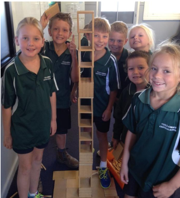
Great teamwork in Year 2/3/4!