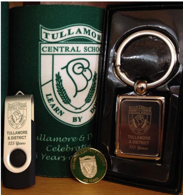
What a great Christmas gift idea !

We still have stock remaining from our 125 year celebrations. Each of the 4 items was originally priced at $10 (stubby holder, commemorative pin, key ring and USB drive). As a special offer if you buy any 2 items you will receive a 3 rd item free. Or if you wish to buy the set of 4 items they are a package deal at $25.