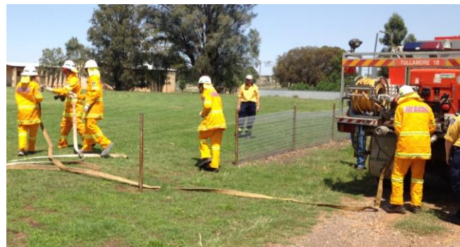
The boys gave a great demo putting out a car fire