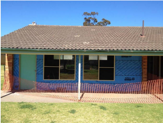
Our new Art room is almost finished!