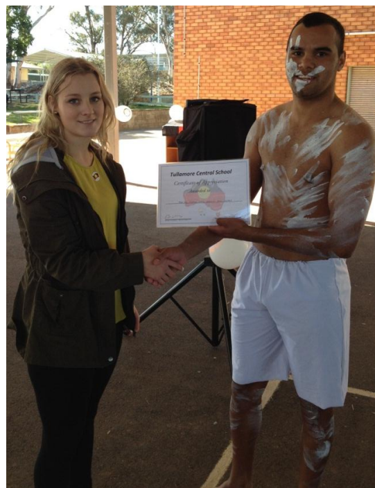
Kylie presenting a certificate to our visiting dancer