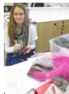
Hard at work with Textiles & Design

Practical experiences are integrated throughout the content areas and includes experimental and project work. HSC students are very busy putting the finishing touches to their Major Textiles Projects, along with the supporting documentation, ready to submit to the Board of Studies for marking.