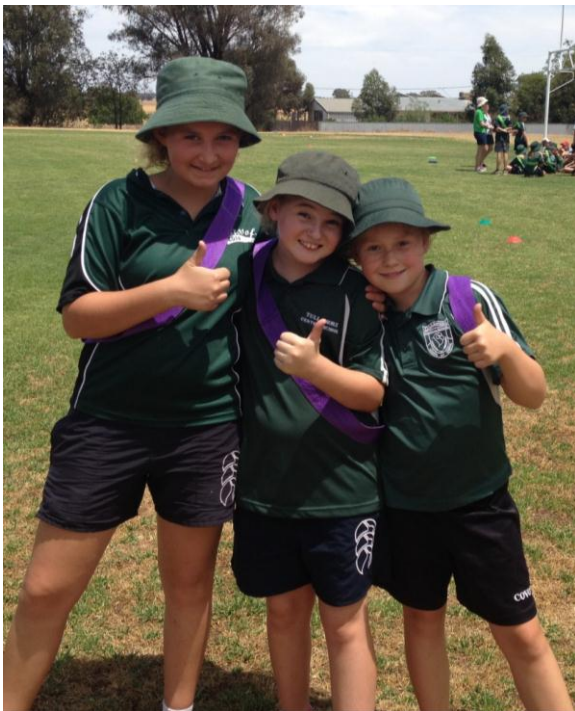
A big thumbs up at the Gobondery Shield

Teachers are currently busy completing yearly school reports and these should be issued to parents during the final week of the school year.