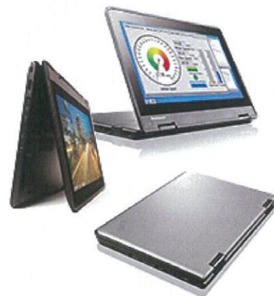
Model shown: Lenovo ThinkPad® 11e Yoga

Simply log on to http://email.targetbase.com.au/t/r-l-ctdkddy-ijrlipyu-r/ and use code DECNSW .