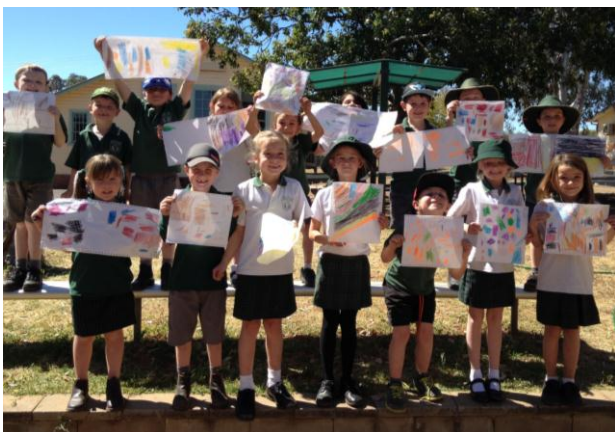
K/1 and their beautiful 'Environmental rubbings'